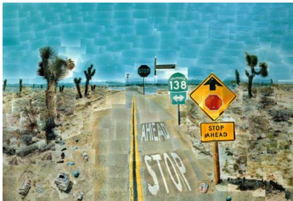
Pear Blossom Highway